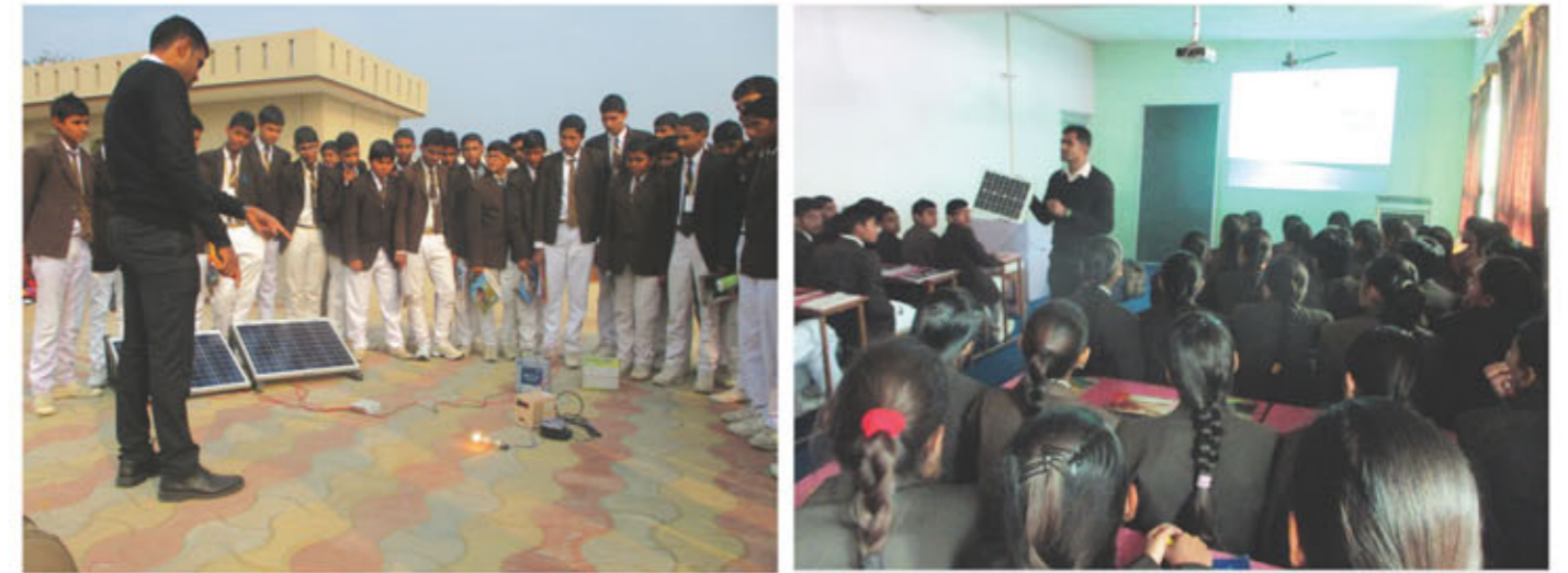
Govt. School, Hansaka, 11 th - 12 th January, 2016