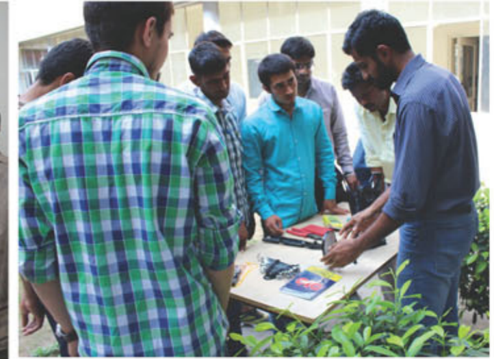
CIDC, Faridabad, 12 th - 15 th March 1, 2016