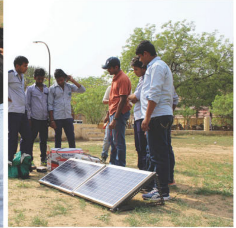
ITI, Faridabad, 11 th - 16 th May, 2015