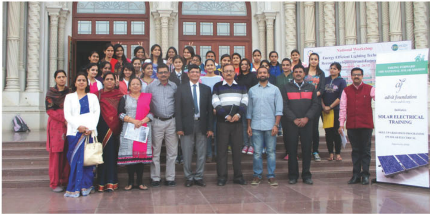
Mody University, 26 th - 28 th November, 2015