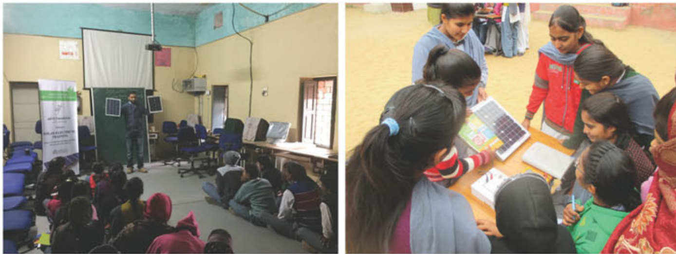
HARTRON Centre, 8 th - 11 th March, 2016